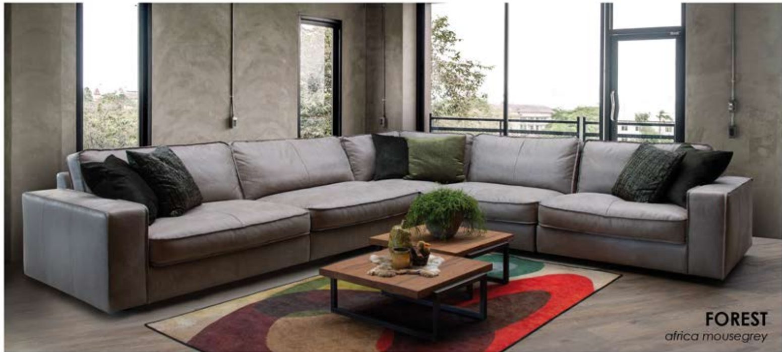
FOREST africa mousegrey