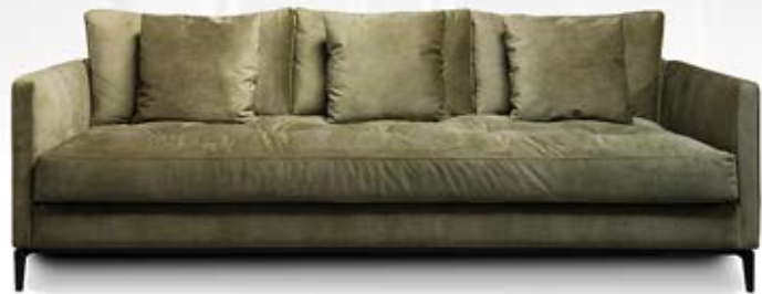
CHESTER vintage velvet dry moss