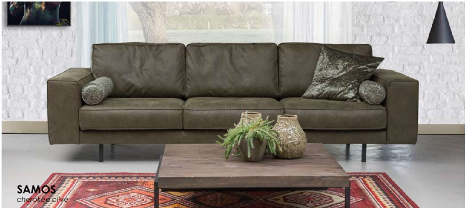
SAMOS cherokee olive