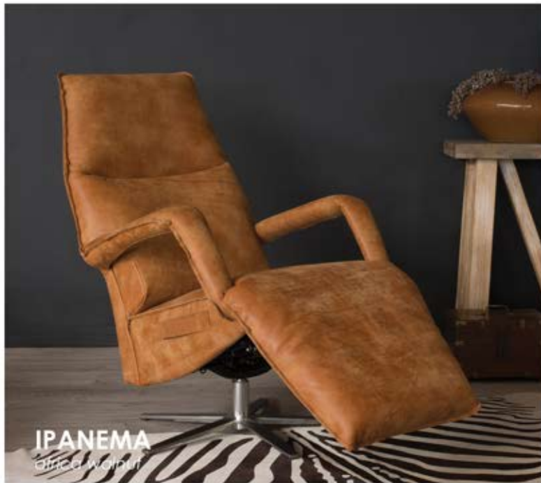
IPANEMA africa wabur