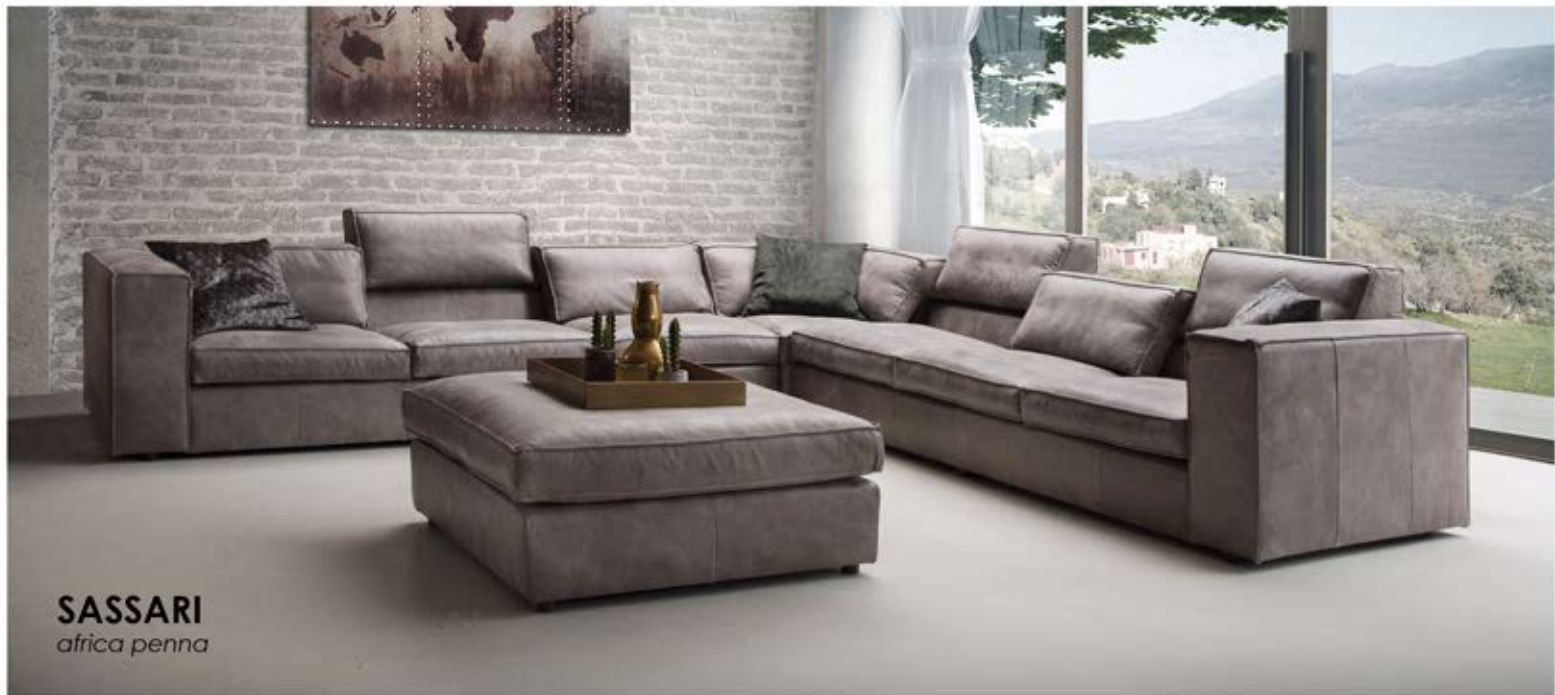
SASSARI africa penna