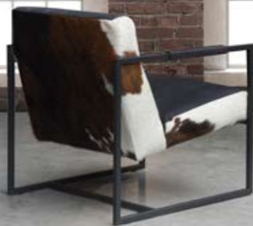
africa superblack / cowskin