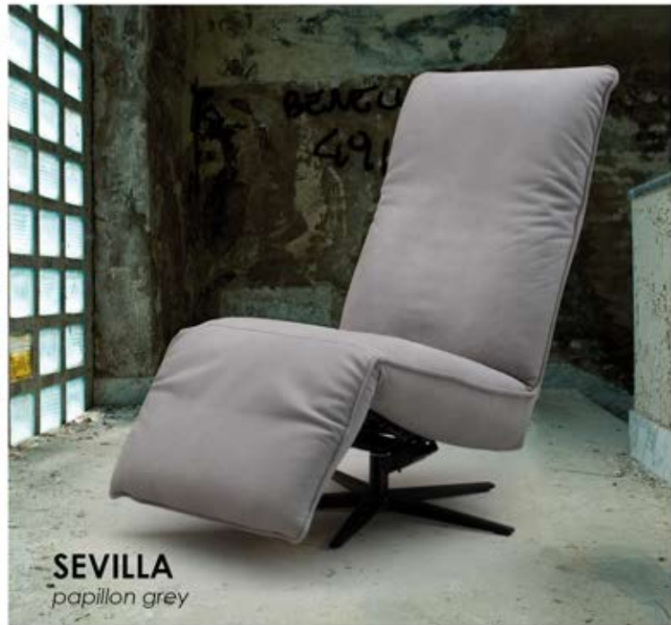
SEVILLA papillon grey