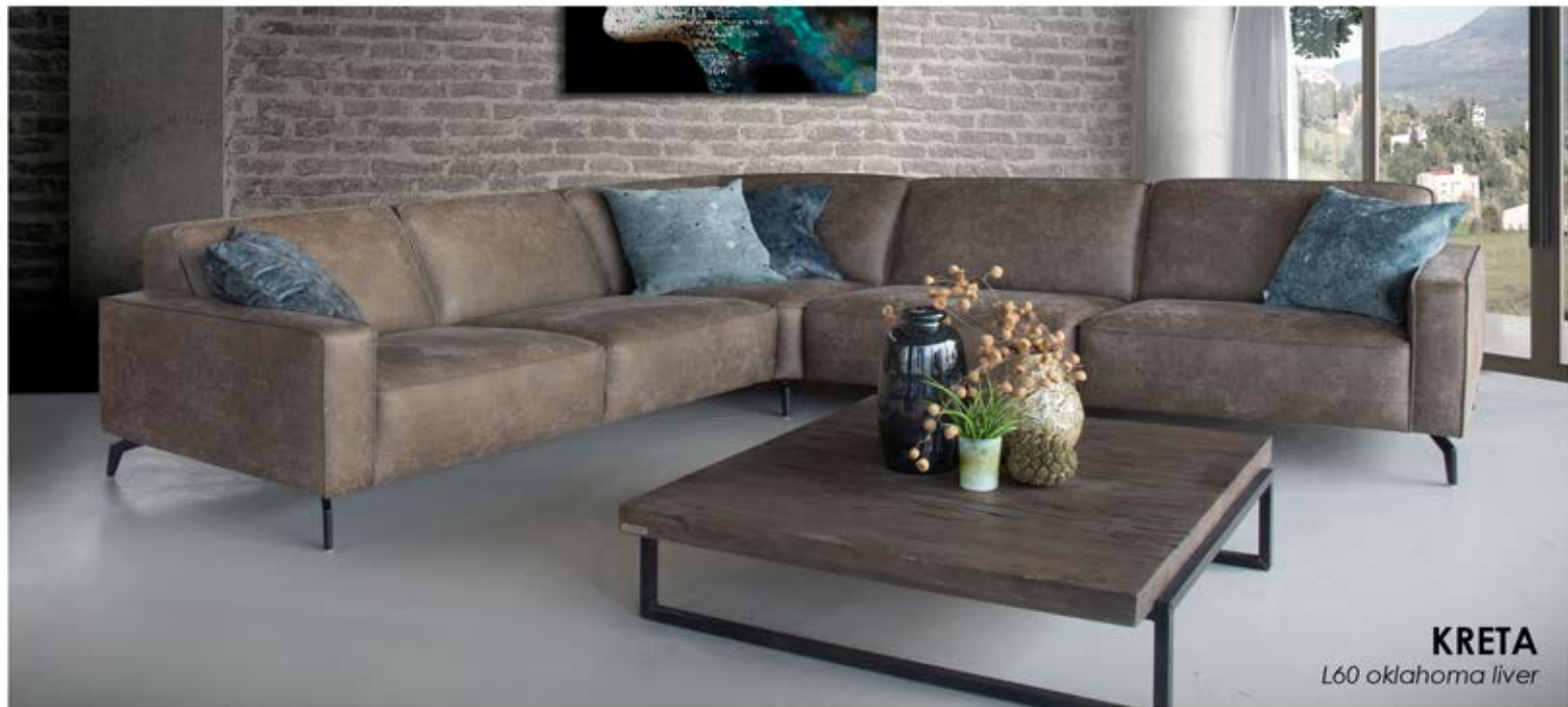
KRETA L60 oklahoma liver