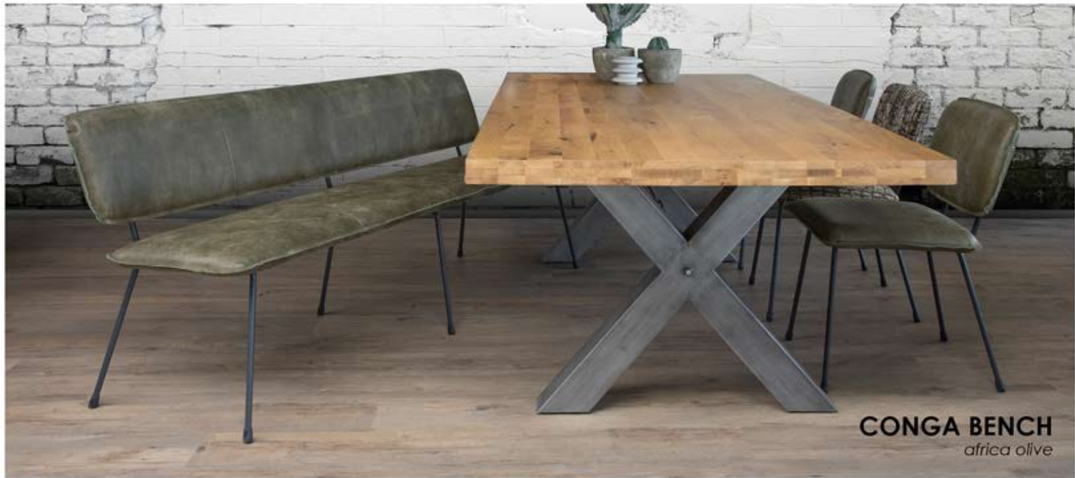
CONGA BENCH africa olive