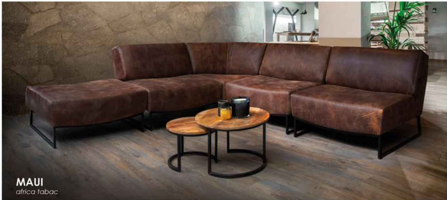
MAUI africa tabac