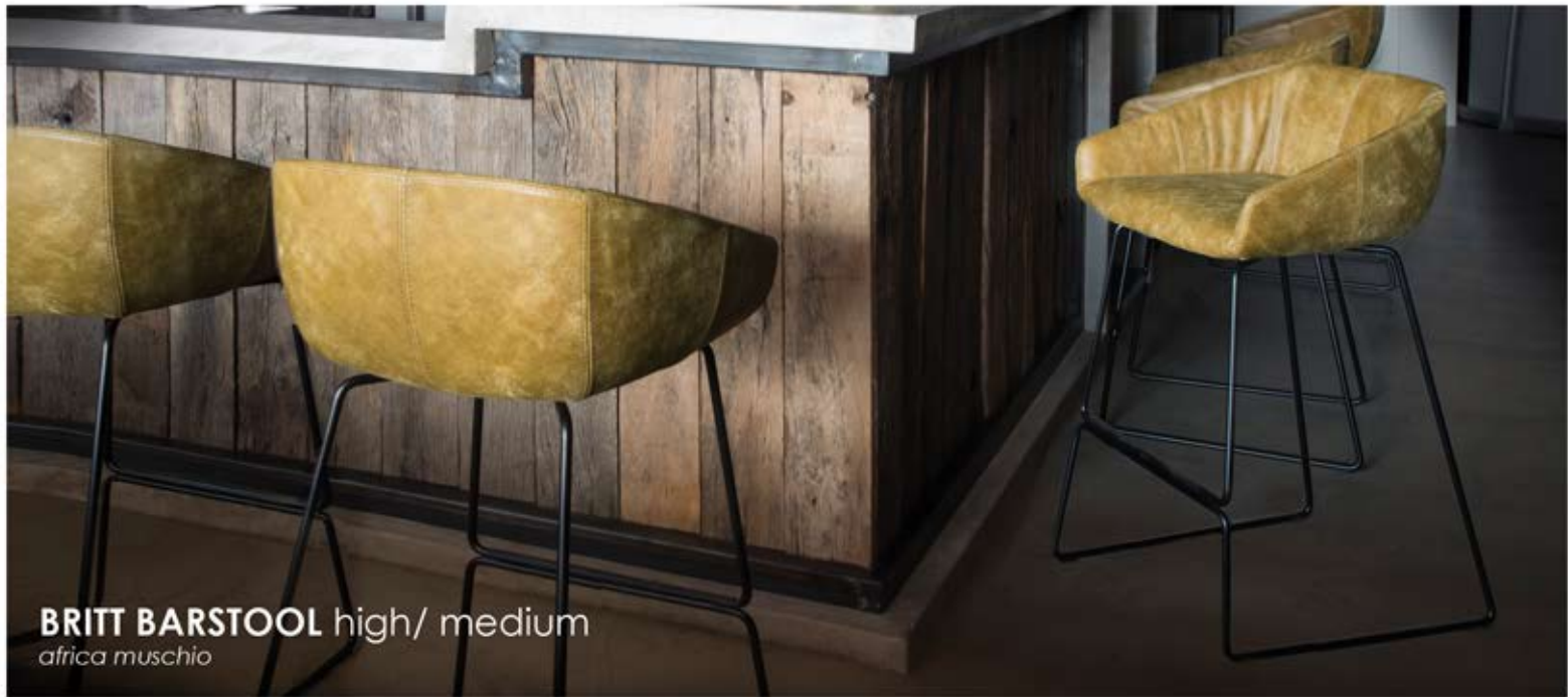
BRITT BARSTOOL high/ medium africa muschio