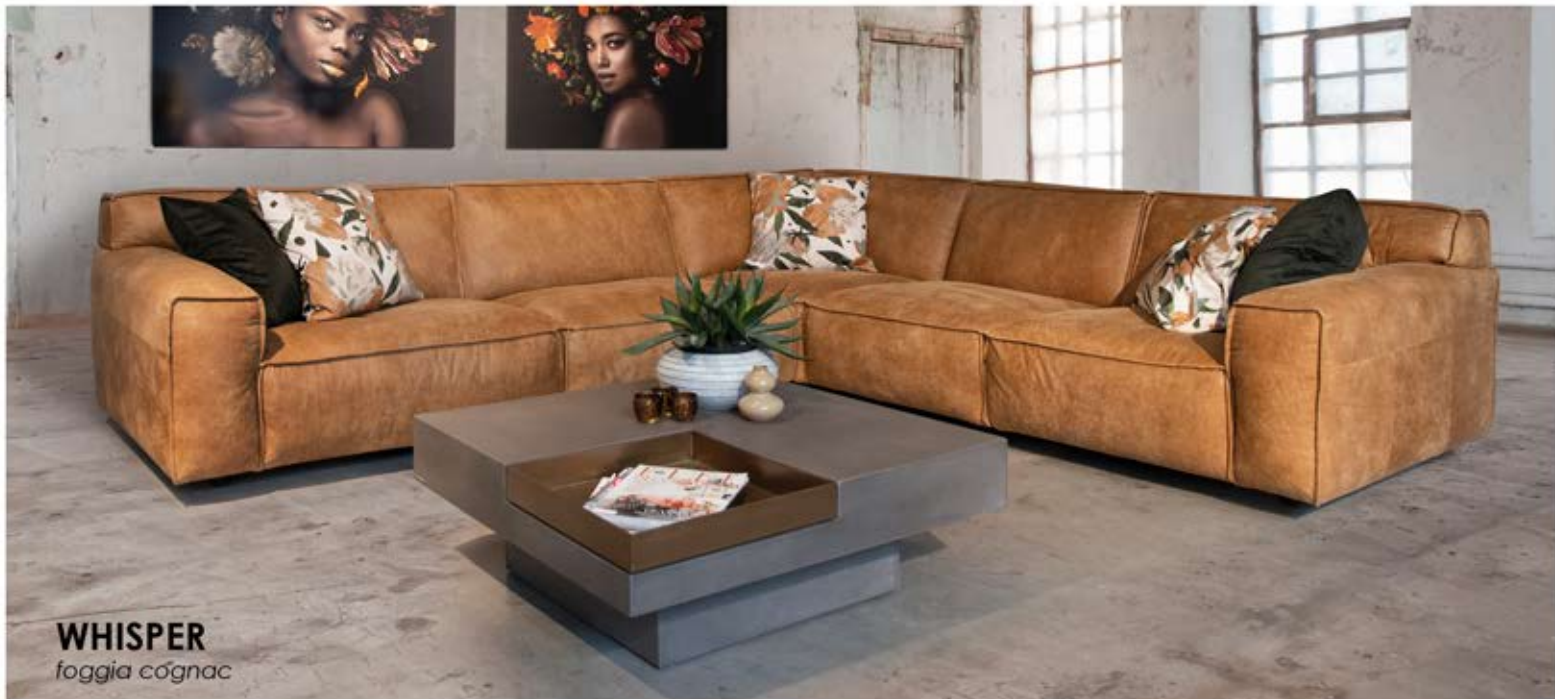
WHISPER foggia cognac